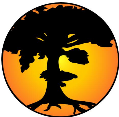
The Victoria-Taiama Partnership