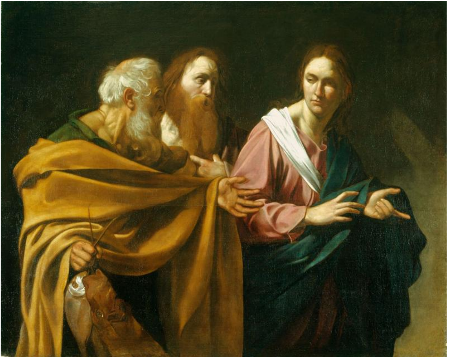
Caravaggio, Michelangelo Merisi da, 1573-1610. Calling of Saints Peter and Andrew, from Art in the Christian Tradition , a project of the Vanderbilt Divinity Library, Nashville, TN. https://diglib.library.vanderbilt.edu/act-image/RC=56285 [retrieved January 13, 2026]. Original source: https://commons.wikimedia.org/wiki/File:Uqueen3.jpg .

We are an inclusive and affirming parish; the sacraments of the church (baptism, communion and marriage) are available to all people on equal terms. Christ welcomes you, and so do we.