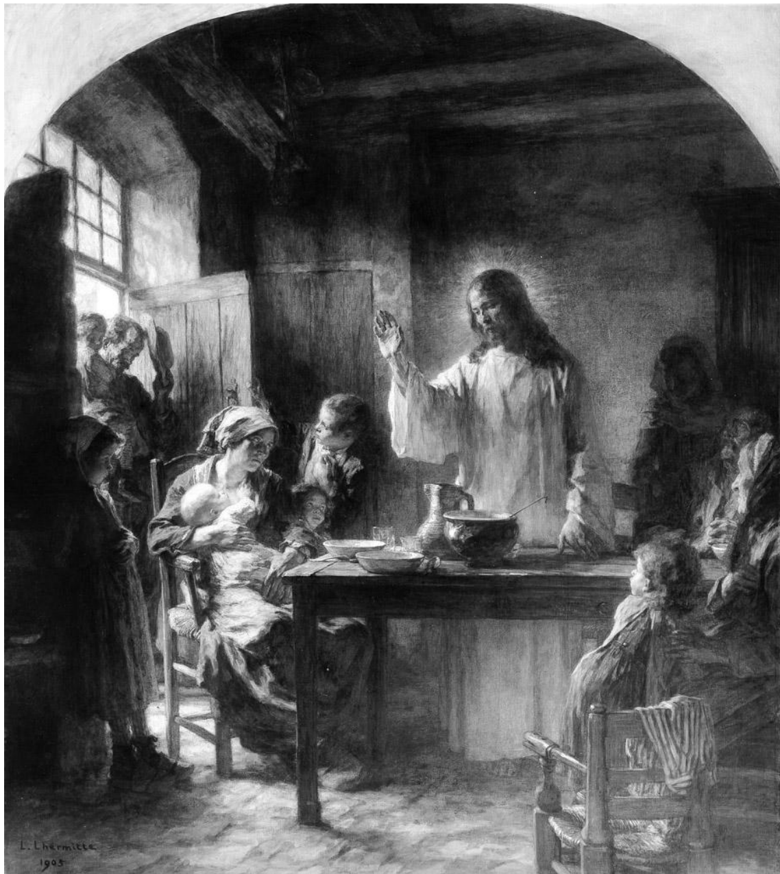
Lhermitte, Léon Augustin, 1844-1925. Among the Humble , from Art in the Christian Tradition , a project of the Vanderbilt Divinity Library, Nashville, TN. https://diglib.library.vanderbilt.edu/act-imagelink.pl?RC=59376 [retrieved August 28, 2025]. Original source: https://commons.wikimedia.org/wiki/File:Among_the_Humble_MET_ep05.38.bw.R.jpg .

We are an inclusive and affirming parish; the sacraments of the church (baptism, communion and marriage) are available to all people on equal terms. Christ welcomes you, and so do we.