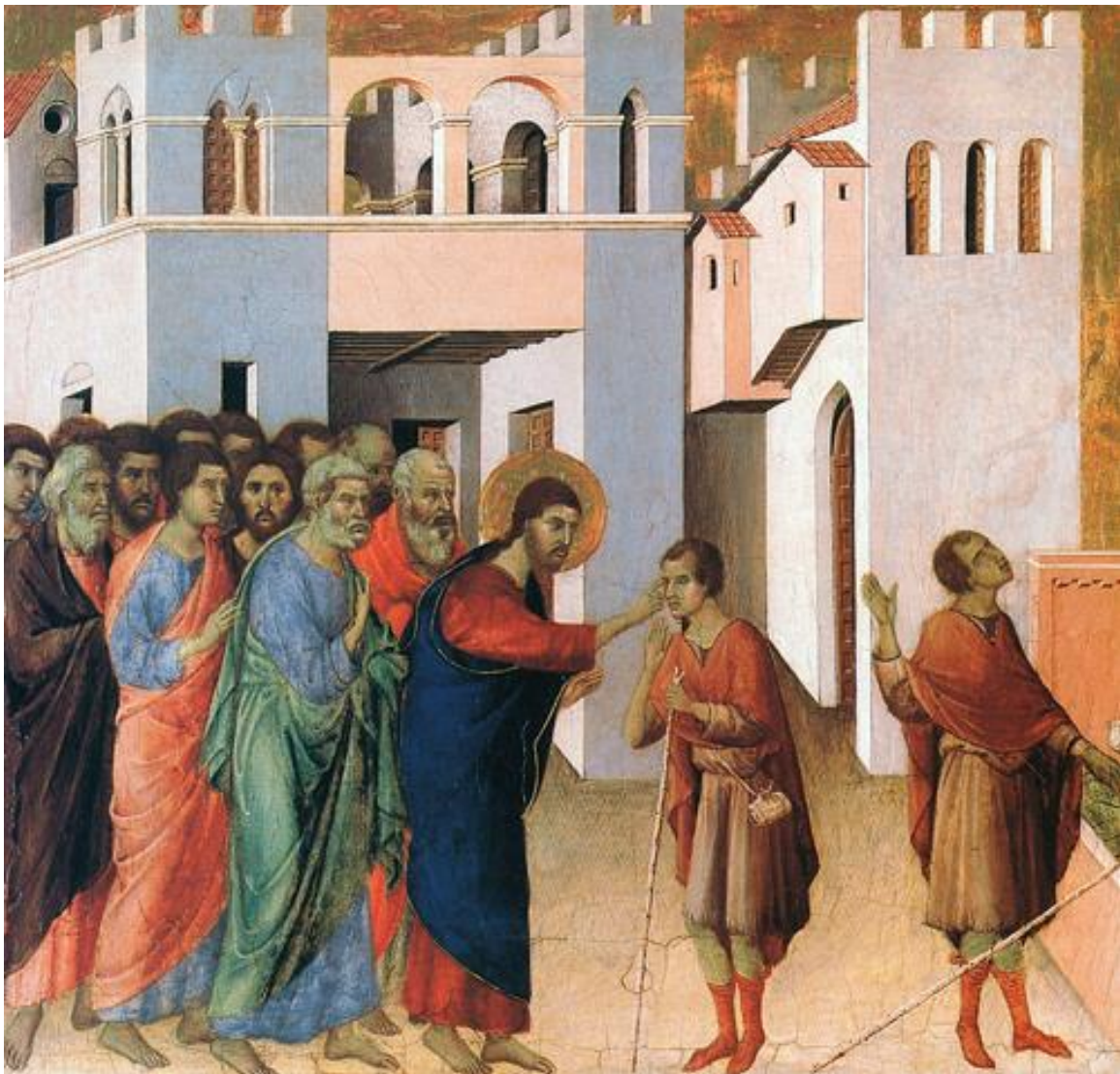
Duccio, di Buoninsegna, -1319?. Healing of the Man Born Blind, from Art in the Christian Tradition , a project of the Vanderbilt Divinity Library, Nashville, TN. https://diglib.library.vanderbilt.edu/act-imagelink.pl?RC=56662 [retrieved March 16, 2023]. Original source: https://commons.wikimedia.org/wiki/File:Duccio_di_Buoninsegna_037.jpg .

We are an inclusive and affirming parish; the sacraments of the church (baptism, communion and marriage) are available to all people on equal terms. Christ welcomes you, and so do we.