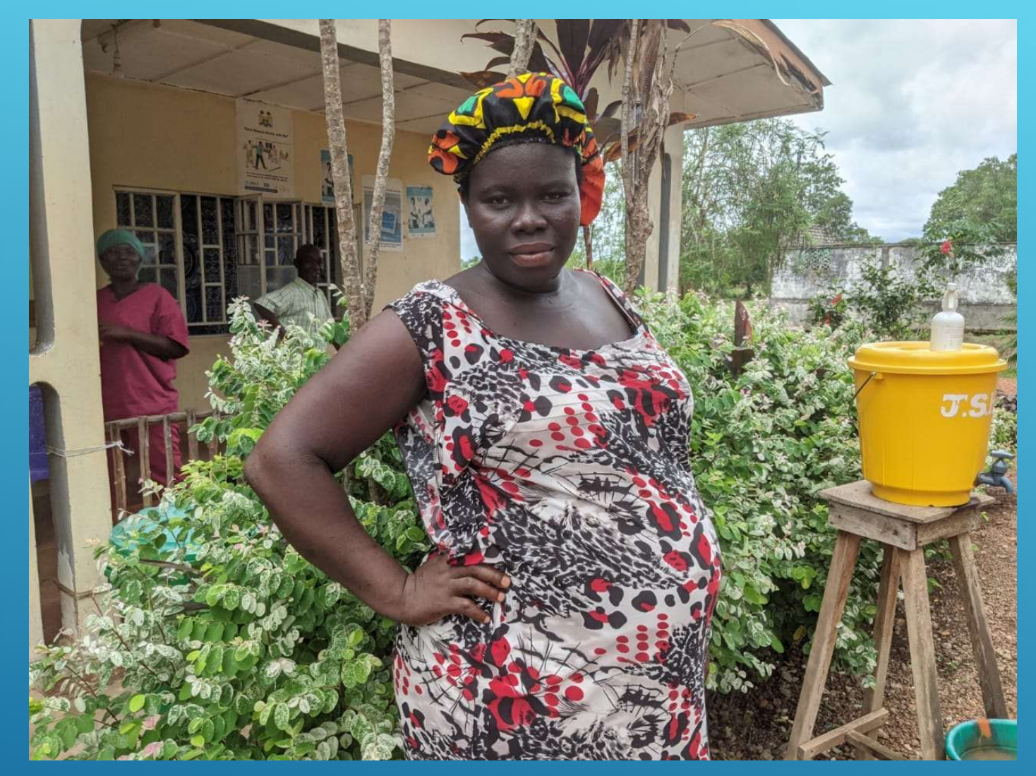
MATERNAL HEALTH PROGRAM