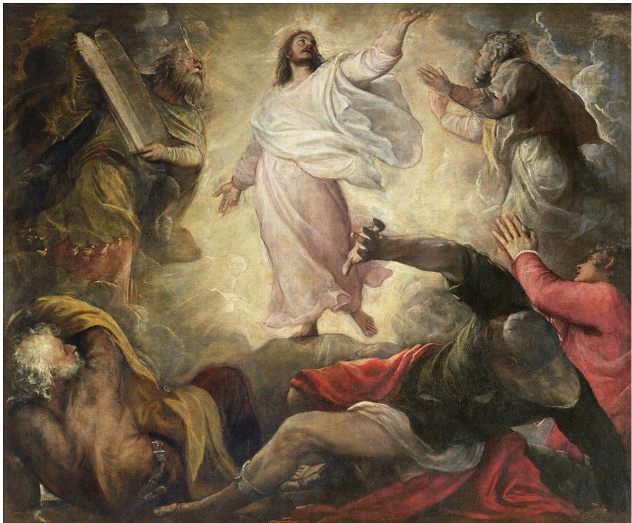
Titian: Transfiguration c.1560. Public Domain

We are an inclusive and affirming parish; the sacraments of the church (baptism, communion and marriage) are available to all people on equal terms. Christ welcomes you, and so do we.