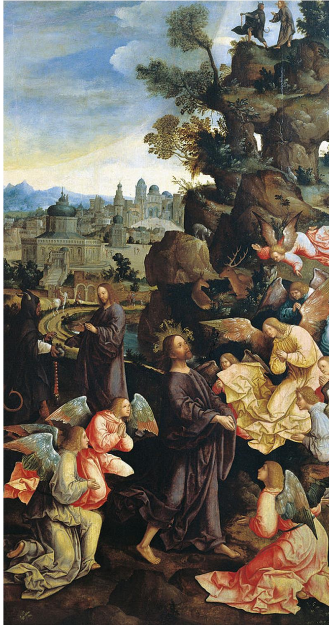
Temptation of Christ

St. John's acknowledges these ancestral territories of the Lekwungen people.